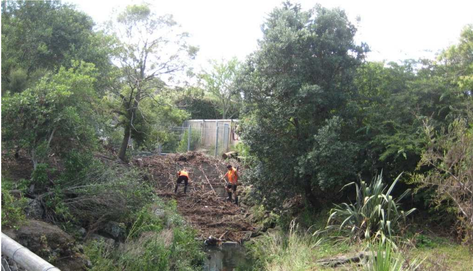
Council workers at Alberton Ave grill after flood