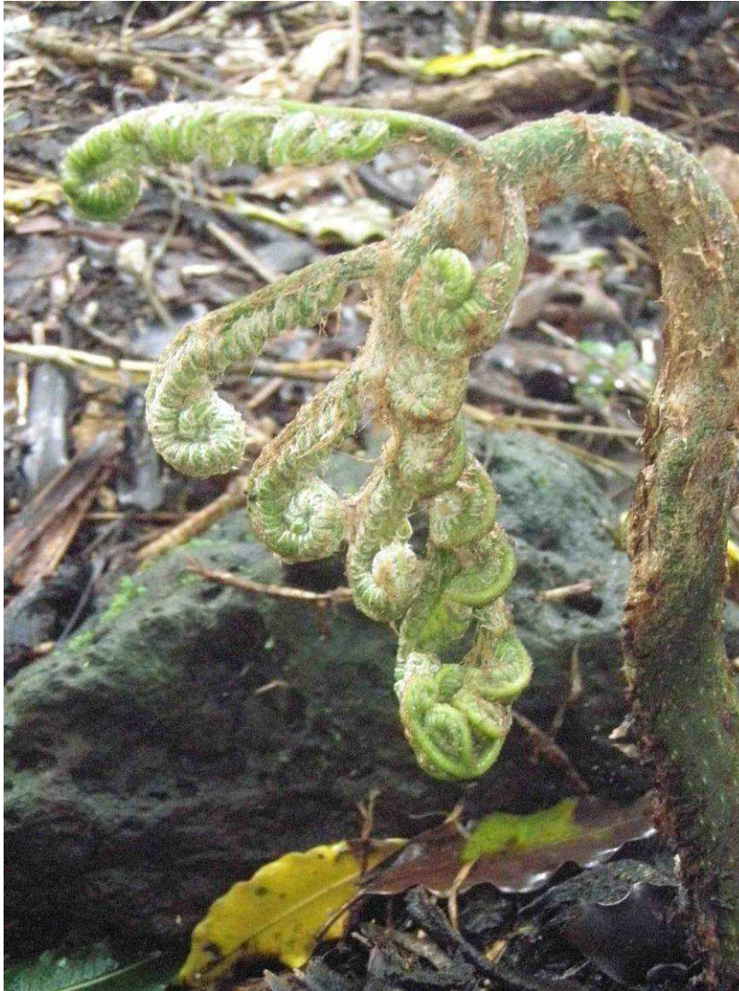
Unfolding King Fern