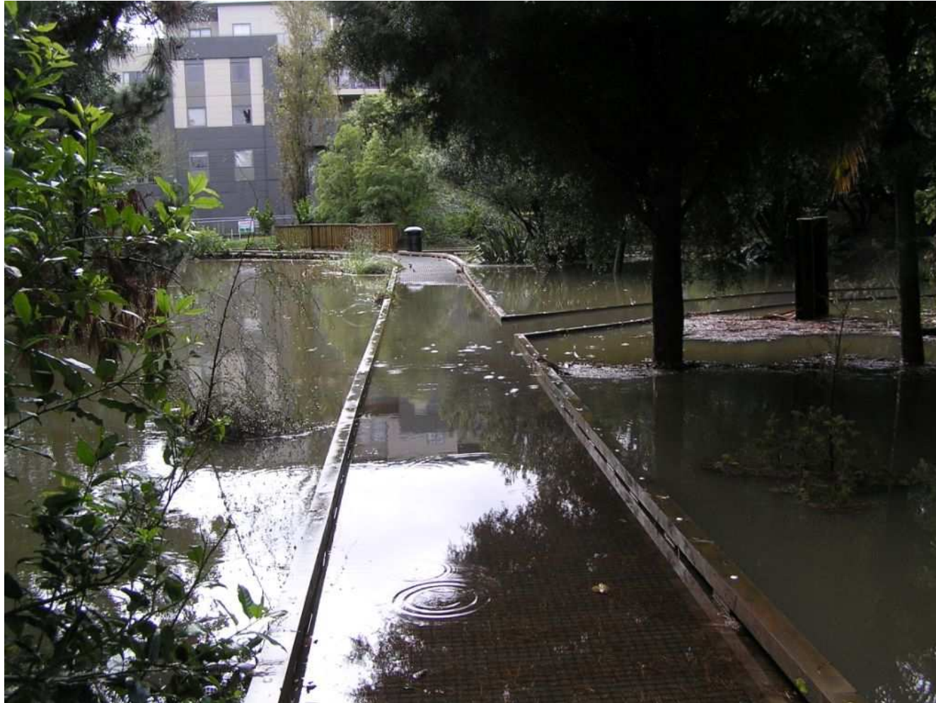
Near Megacentre and St Lukes Garden Apartments