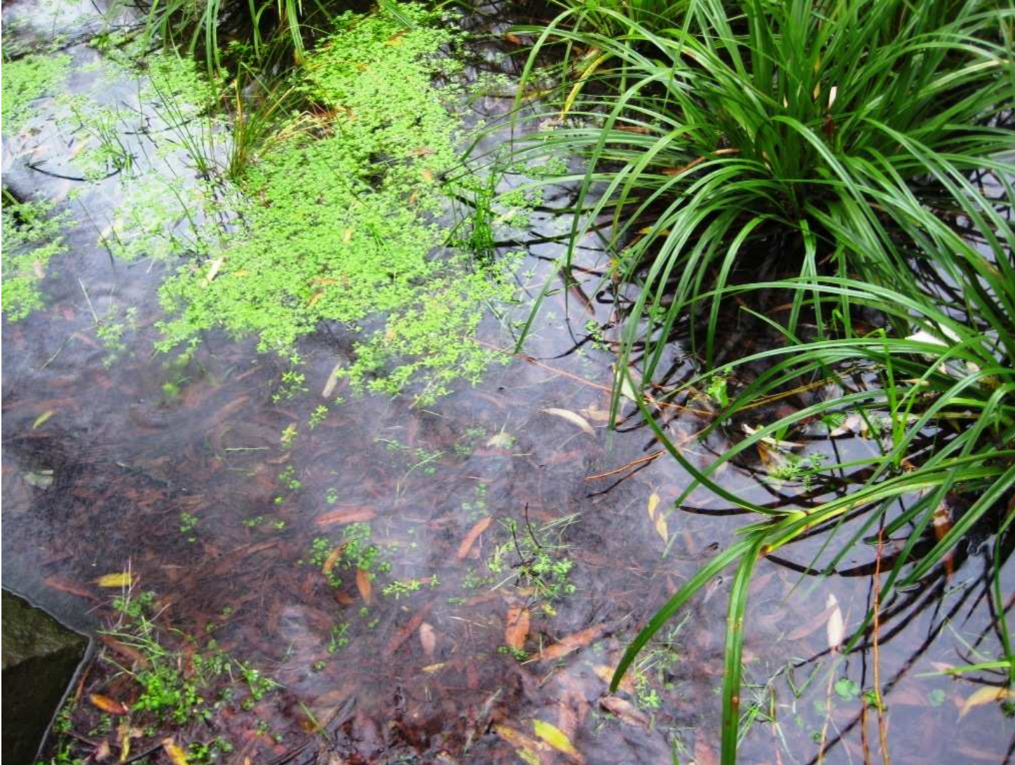
Watercress and Cyperus plants on spring 1 year after planting.