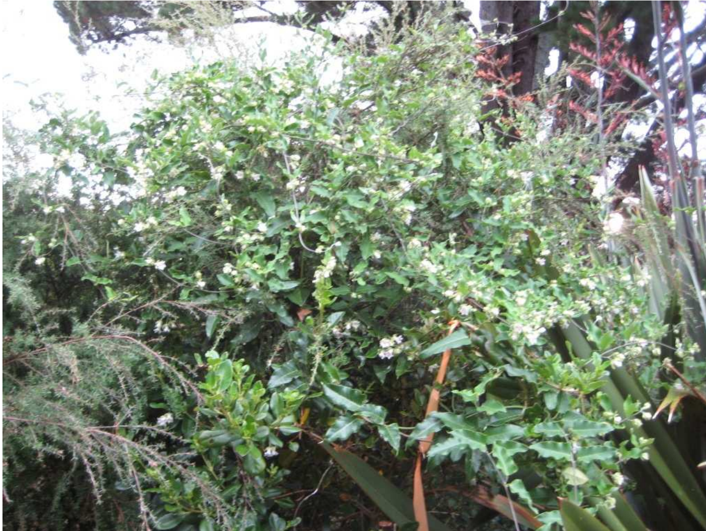
Moth Plant in flower