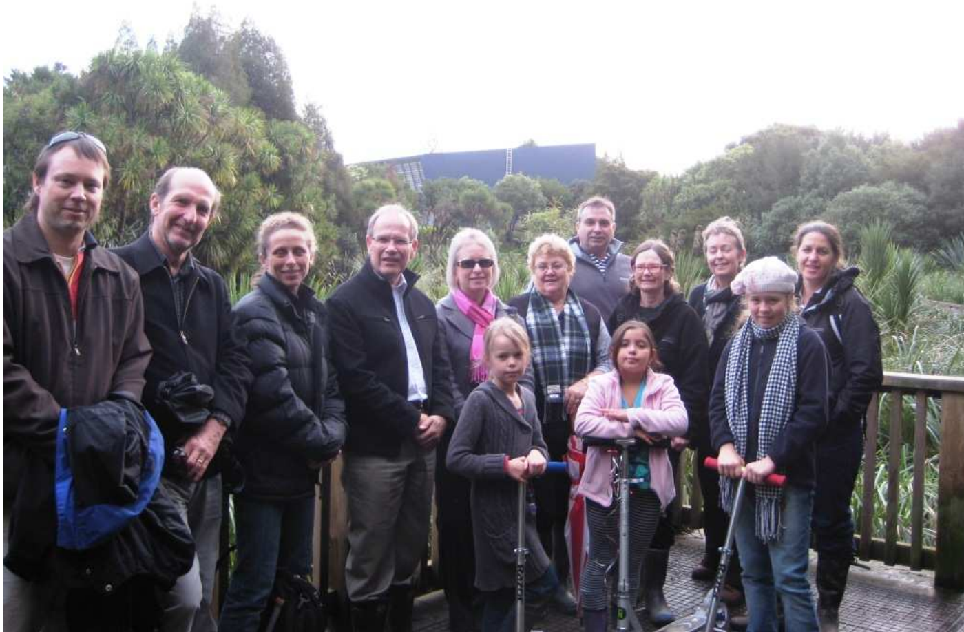
The Mayor, local Board members, council officers and STEPS