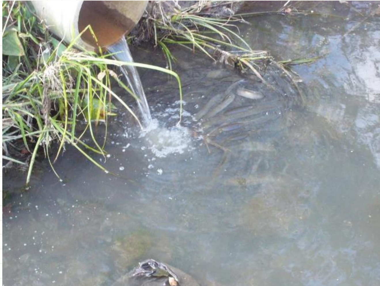
Eels seeking oxygen from inlet – January 2007 Meola Creek