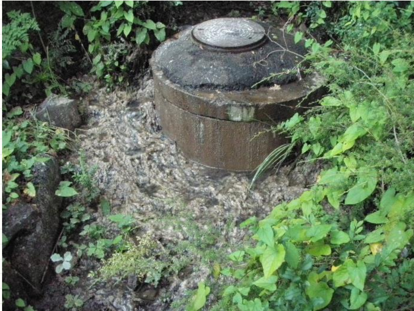
Manhole overflow at Oakley