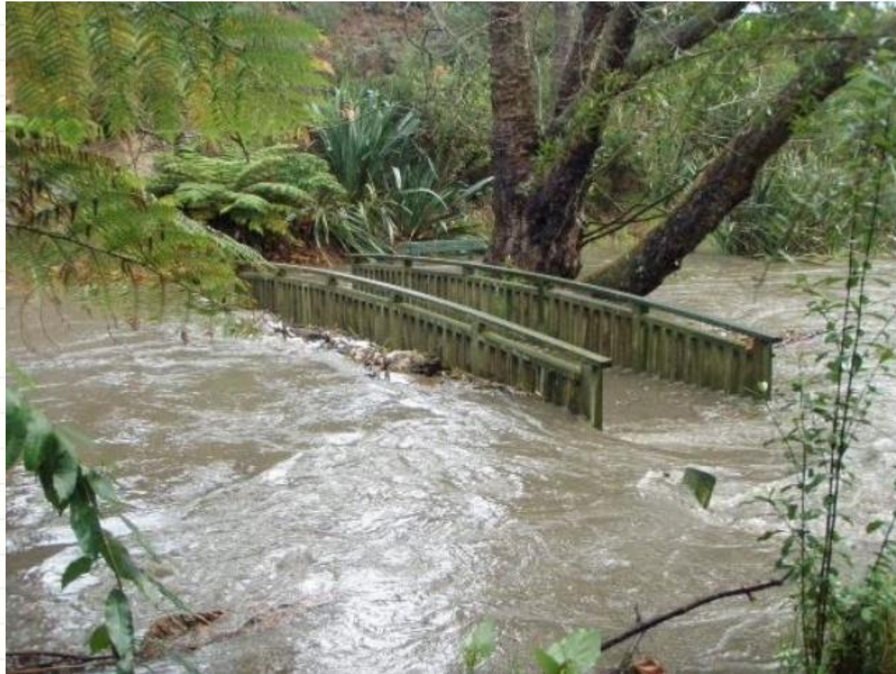
Oakley bridge in stormwater/sewage flood