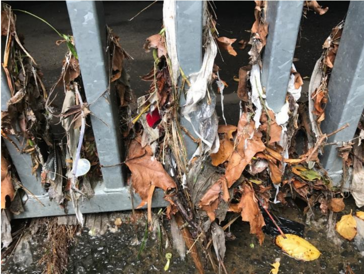
Edendale Branch sewer outfall