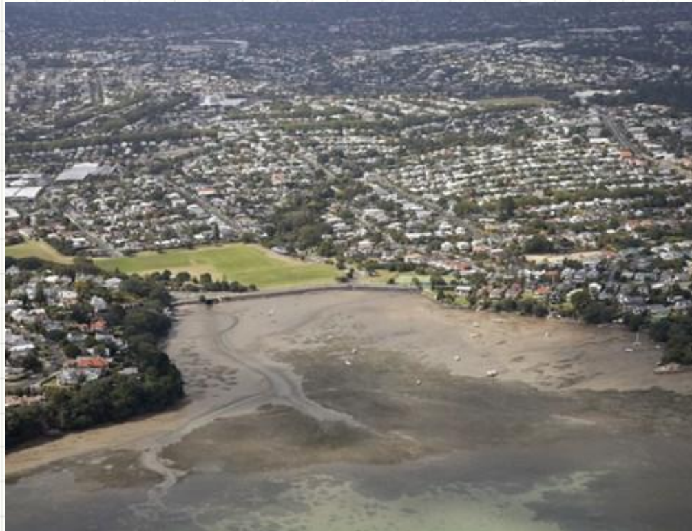
Sediment at Waterview