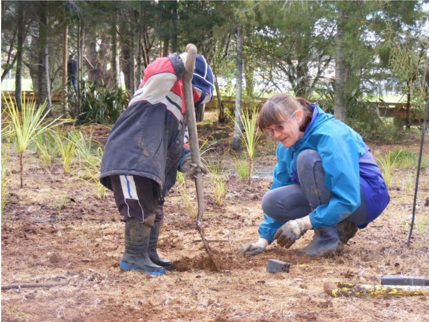
Planting the wetland May 2009, Roy Clements Treeway, Meola Creek