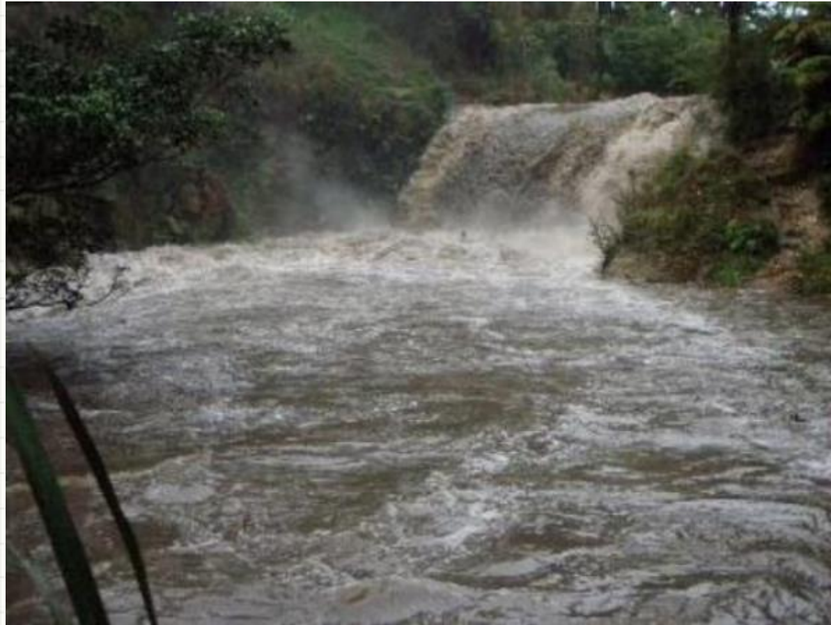
Oakley waterfall in flood – stormwater and sewage