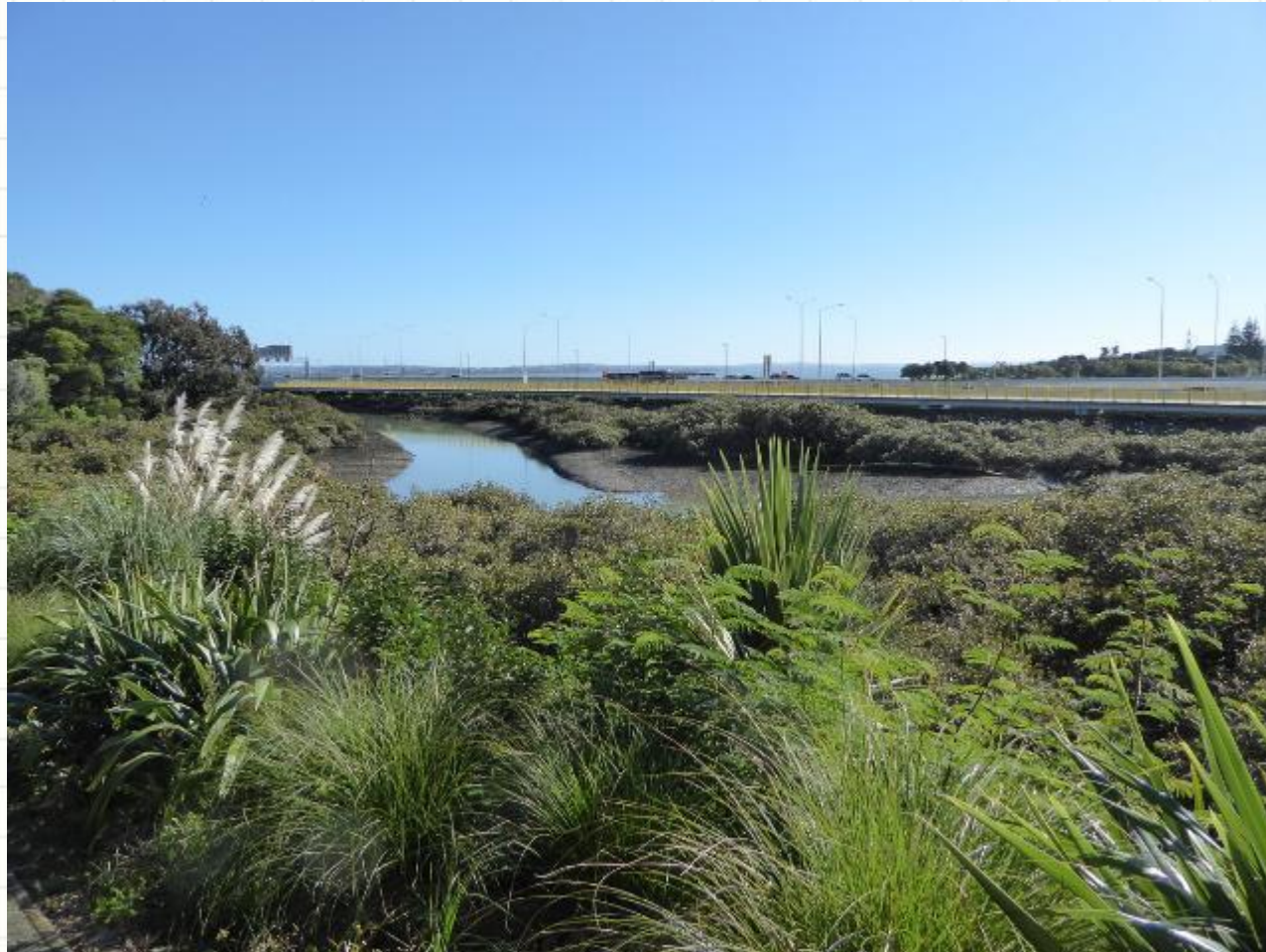
Sediment at Waterview