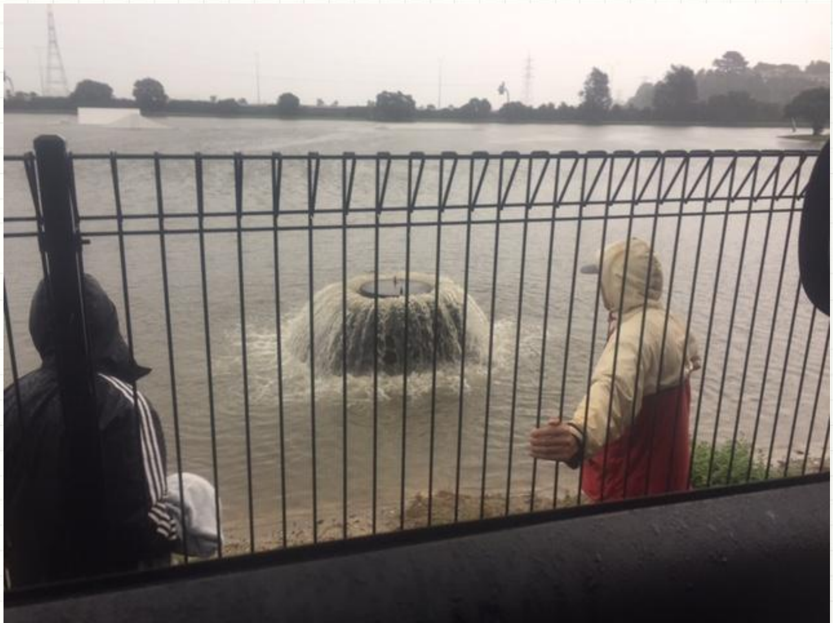
Sewage overflows in Onehunga Lagoon March 2017