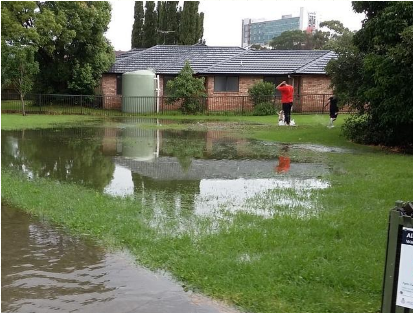
Man washing dog in sewage overflow in Kerr Taylor Park, March 2017