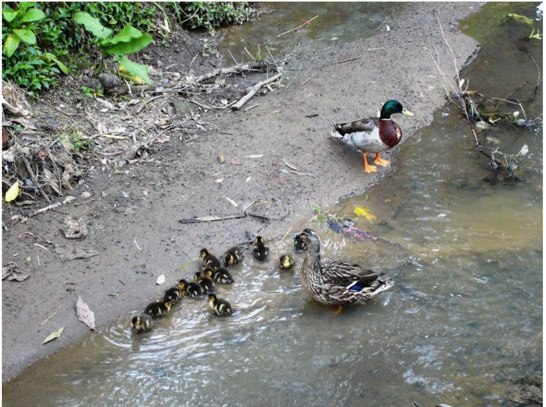
Ducklings on sediment Meola creek